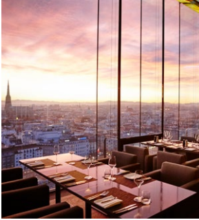
Senior Dialogues, Formal Reception & Dinner at The Loft, SO/ Vienna