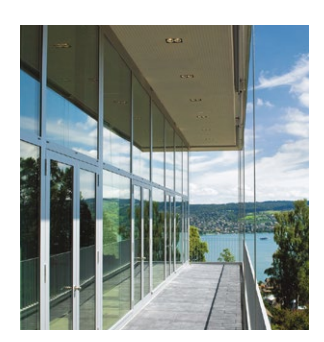
Senior Executive Conference at GDI

BankersCom c/o sminds AG Nordstrasse 9, CH-8006 Zurich Tel. +41 44 260 10 60 contact@sminds.ch www.bankerscom.ch