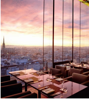
The Loft, SO/ Vienna