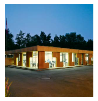
Embassy of Switzerland Beijing